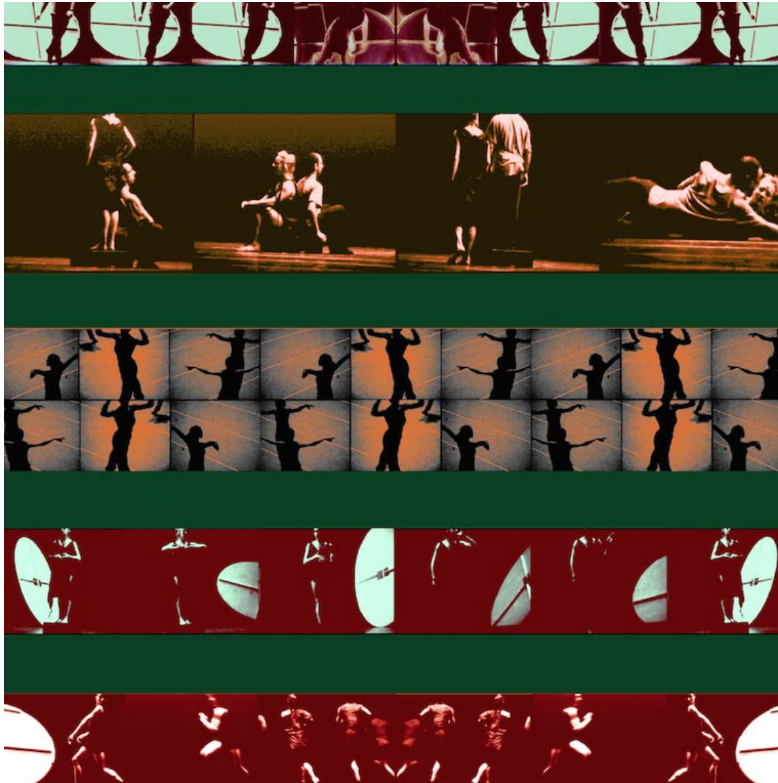
Fiona Léus Lambert Frankfurt Ballet II Shot using Super 8 film 60 x 60cm Pigment print