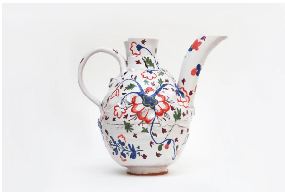
Elin Hughes ABERA ERON EWER (STÉN ABERAERON) , 2021 Earthenware clay with majolica glaze and decals 32 x 35 x 20 cm £480