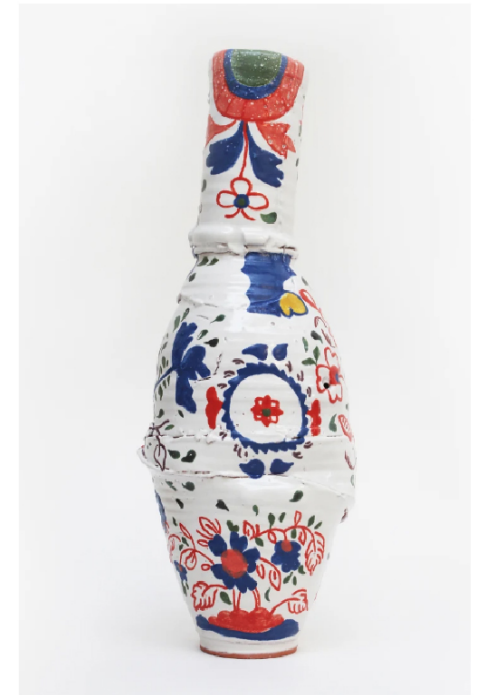
Elin Hughes SUNFLOWER BOTTLE (BOTEL BLODYN YR HAUL) , 2021 Earthenware clay with majolica glaze and decals 45 x 15.5 x 15 cm £480