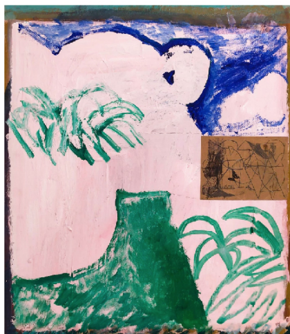
Spencer Shakespeare YOU & ME, 2021 Oil, acrylic, oil stick on raw canvas 71 x 61 cm £1100