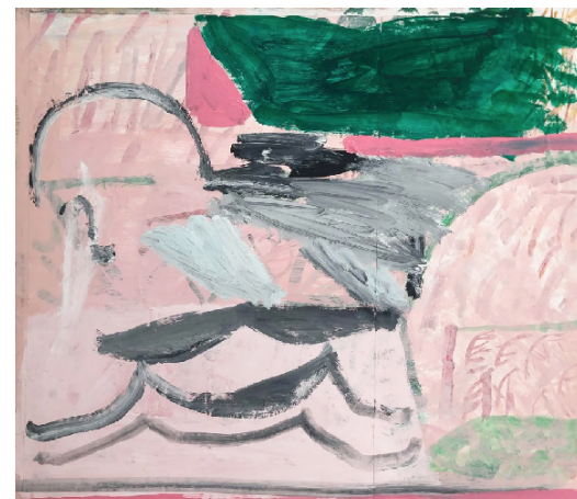
Spencer Shakespeare RUNNING WITH THE HARE, 2021 Oil, acrylic, oil stick on raw canvas 61 x 71 cm £1100