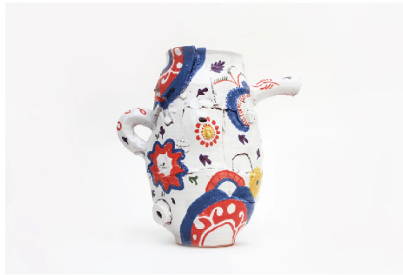
Elin Hughes GOWER JUG (TEBOT Y GWYR) , 2021 Earthenware clay with majolica glaze and decals 29.5 x 29 x 18 cm £420

Elin is a Spring goddess, making vases, breaking vases and reconstructing vessels with such jauntiness and fluency of historical referencing they make the heart sing. Her new pots pay homage to the cobalt blue and iron red foliage and flowers motifs on Victorian Gaudy Welsh pottery, English and continental Imari ware. Elin has sourced designs but her flowers are hand drawn; revived and relaxed they have broken free from 18c pattern books. Feminine whimsy is personified in a teapot like vessel with a spout, handle and complementary nipple - wide-bosomed Gaia.