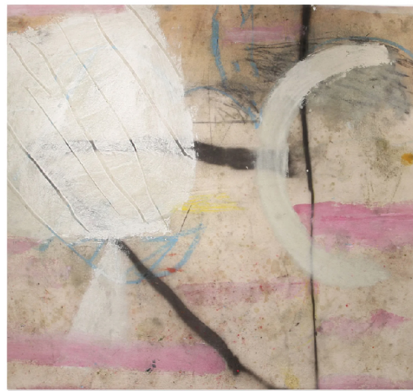
Spencer Shakespeare GEMINI LOVERS, 2018 Oil, acrylic, oil stick on raw canvas 107 x 97 cm £2200