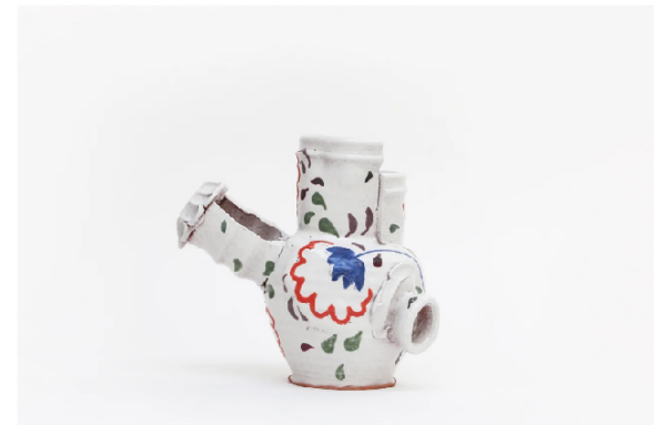
Elin Hughes USK JUG (JWG BRYNBUGA) , 2021 Earthenware clay with majolica glaze and decals 18 x 20 x 12.5 cm £280