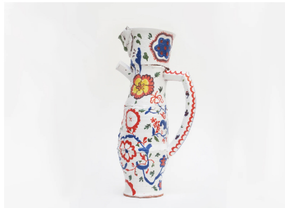
Elin Hughes DENBIGH JUG (JWG DINBYCHI) , 2021 Earthenware clay with majolica glaze and decals 47 x 21.5 x 15.5 cm £520