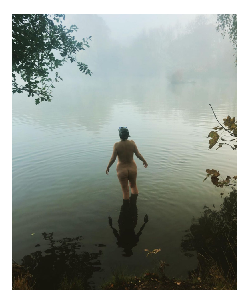
NUDE IN THE VALE 40 x 50 cm Digital print on archival photographic paper