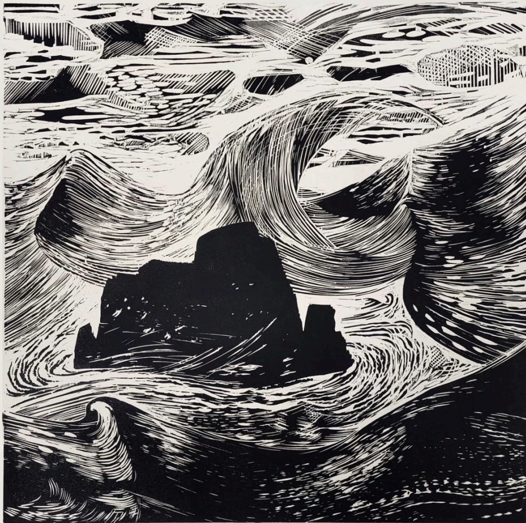
Weather Pattern, 2024 Original Woodblock Print 58 x 58 cm Edition of 60

£690 unframed £920 framed (as seen at LAF)