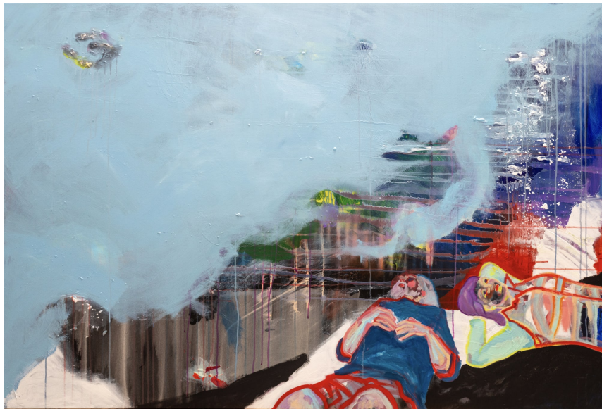
TOGETHER AT VALKYRIE OCTOPUS, 2024 Acrylic on canvas 120 x 180 cm Signed, titled and dated on reverse