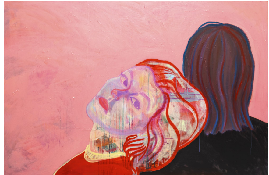
LEAN, 2024 Acrylic on canvas 120 x 180 cm Signed, titled and dated on reverse